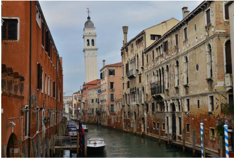
Leaning tower of Venice