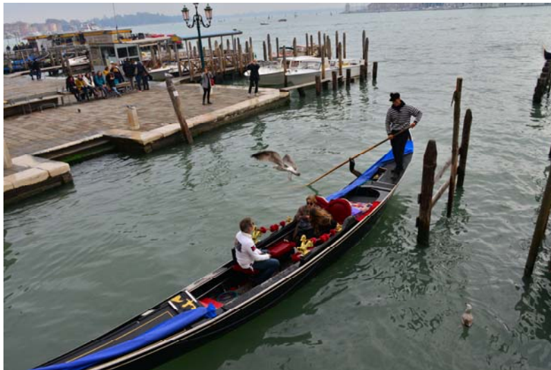
Gondola and seagull near San Marco