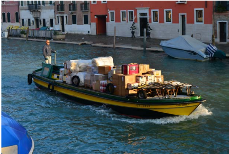
Supply boat on canal