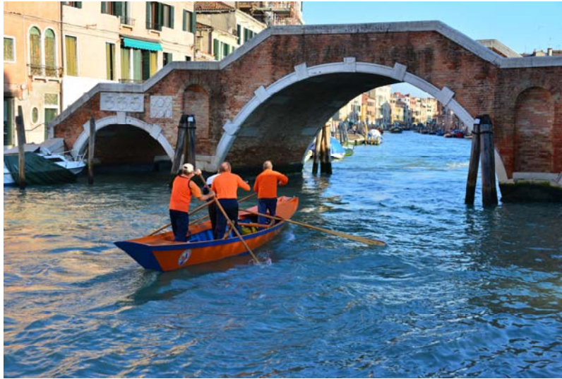
Elderly rowing team - Venice 1nov12