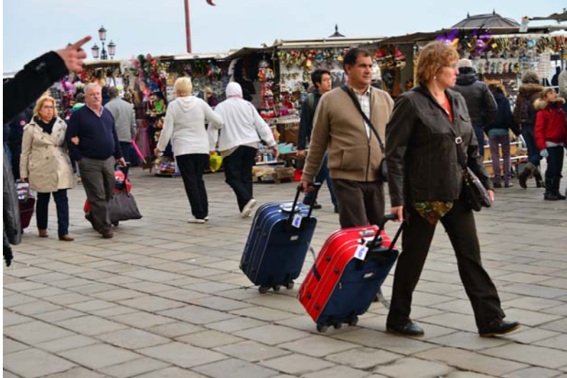
Transport in Venice is only by boat or by foot