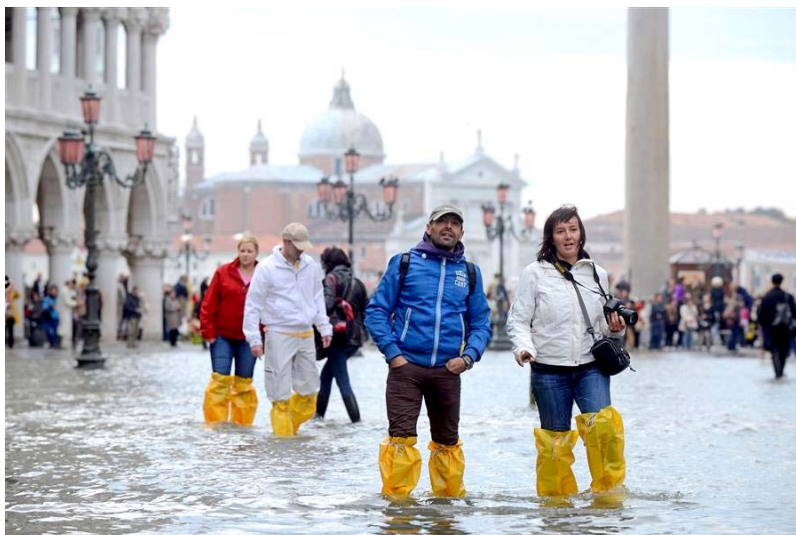
Walking in venice on oct 31 2012