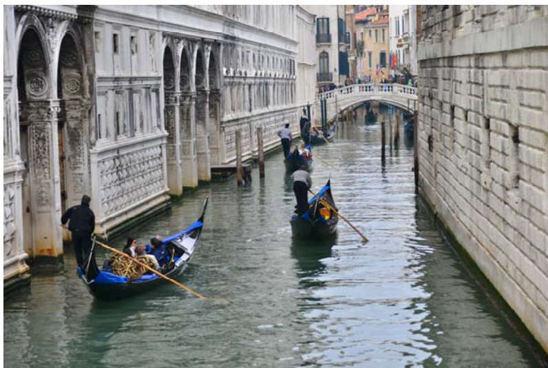
Gondolas in canal behind Basilica