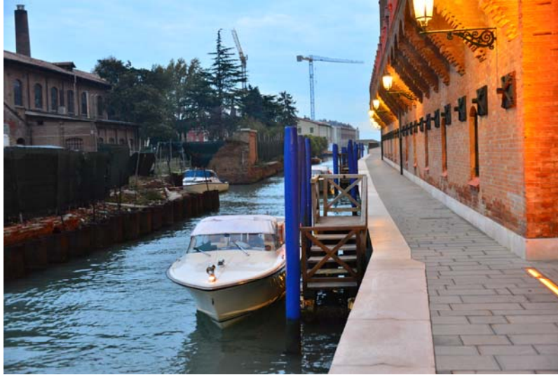
Arrival by water taxi from airport