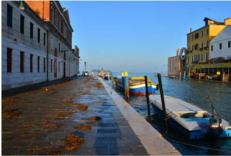
Seaweed washed up from oct 31 2012 high water