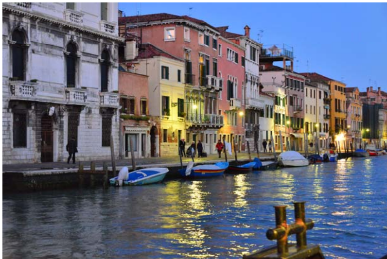
Canal Cannaregio Venice 1Nov12