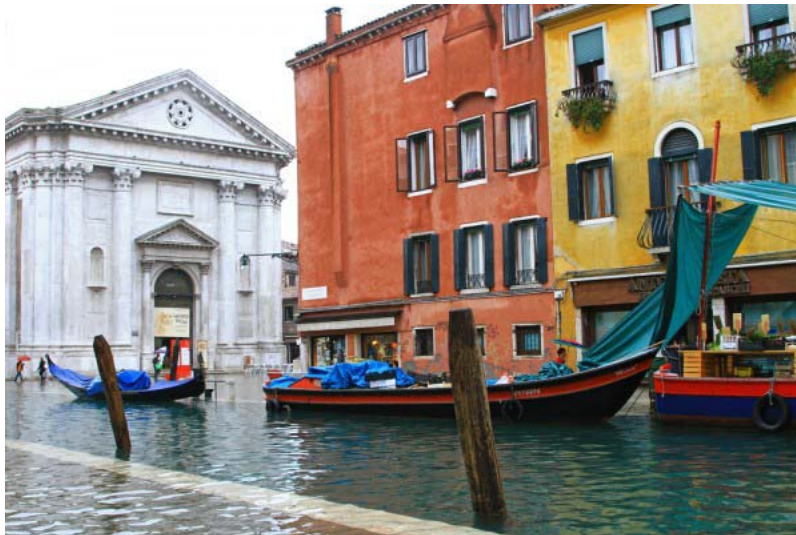
Typical overflow onto sidewalks during highwater