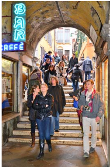
Shopping crowds in central Venice 3nov12