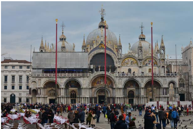
San Marco Basilica and crowds 3nov12